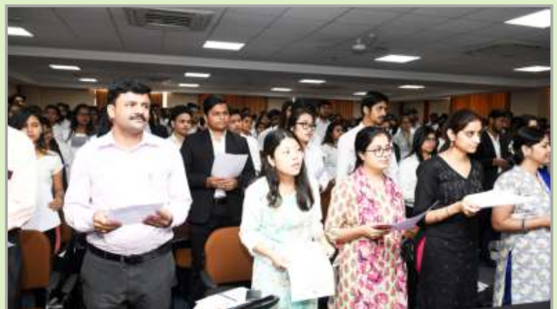
The audience at Law Day & Justice Y.V. Chandrachud Memorial Public Lecture