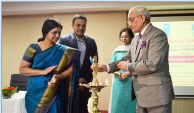
Inauguration of the Regional Workshop on Biodiversity