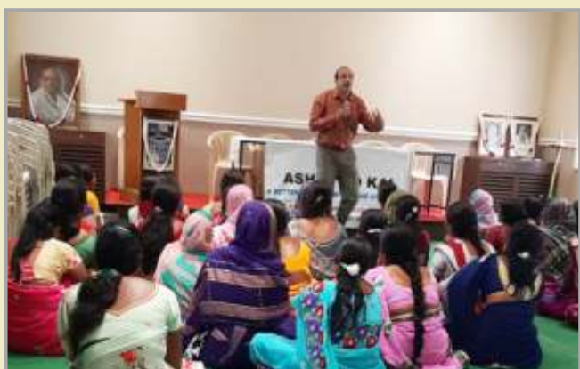
Training Session on Legal and Financial Literacy