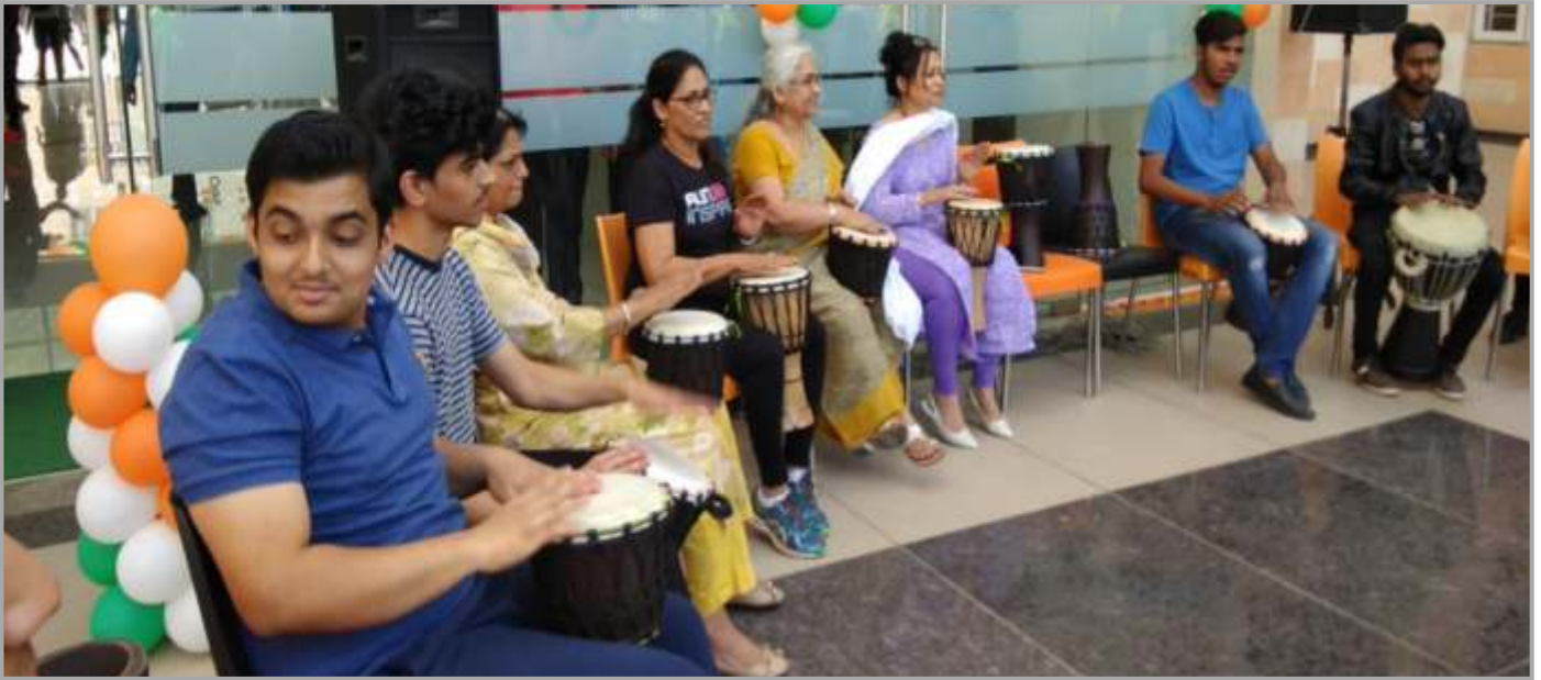
Participants engaging in the Drum Circle organised as a part of the Happy, Healthy Campus Event.

The Happy, Healthy Campus Event was hosted at New Viman Nagar Campus of Symbiosis International University on 10th January 2019 between 11 am to 1 pm. This two-hour event was filled with fun, physical activities and adventure games which honed the physical, social and moral capacities of the participants. The objective of this event was to promote health and wellness amongst the students, faculty and the staff.