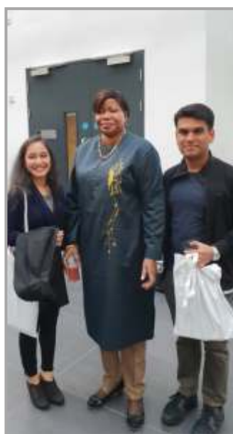
Our students with ICC Prosecutor Fatou Bensoudaat International Criminal Law Summer School