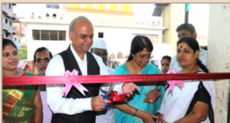
Inauguration of Symbiosis Legal Aid Clinic, Sus Gaon