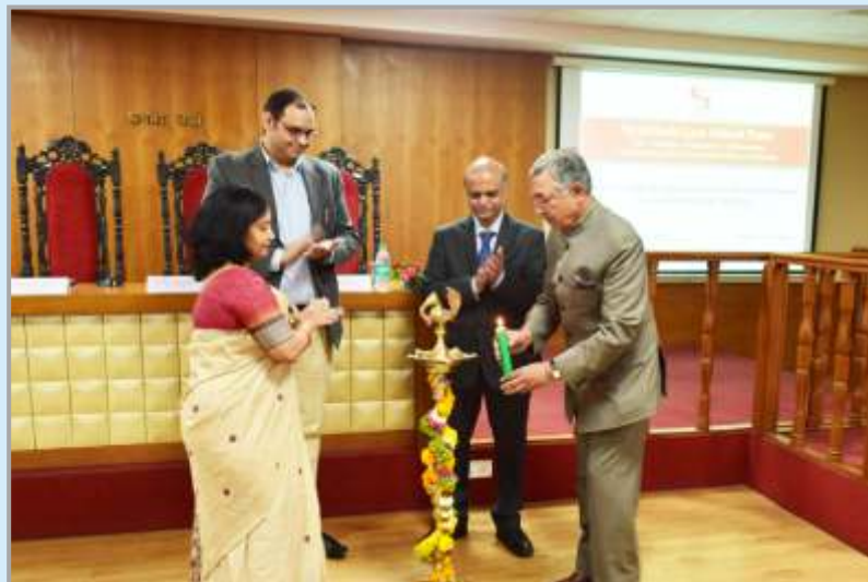
Inauguration of the Nani A. Palkhivala Memorial Inter-Collegiate Elocution Competition