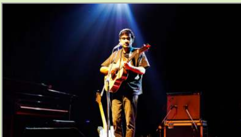
Prateek Kuhad performing on Day 1 of Symbhav 2019