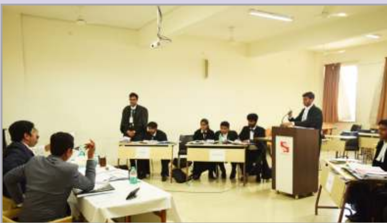
Participants advancing their arguments before the judges