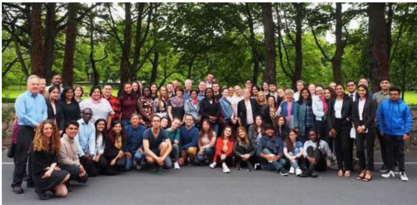
Symbiosis Law School, Pune students at National University of Ireland, Galway with Directors.