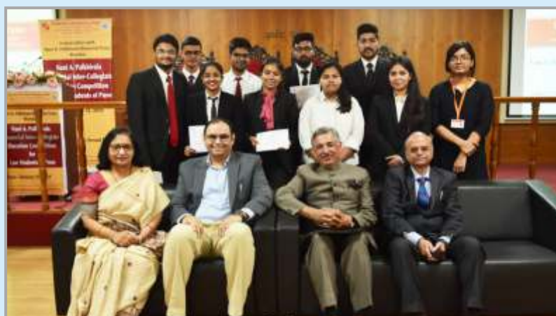
Participants of the Nani A. Palkhivala Memorial Inter-Collegiate Elocution Competition