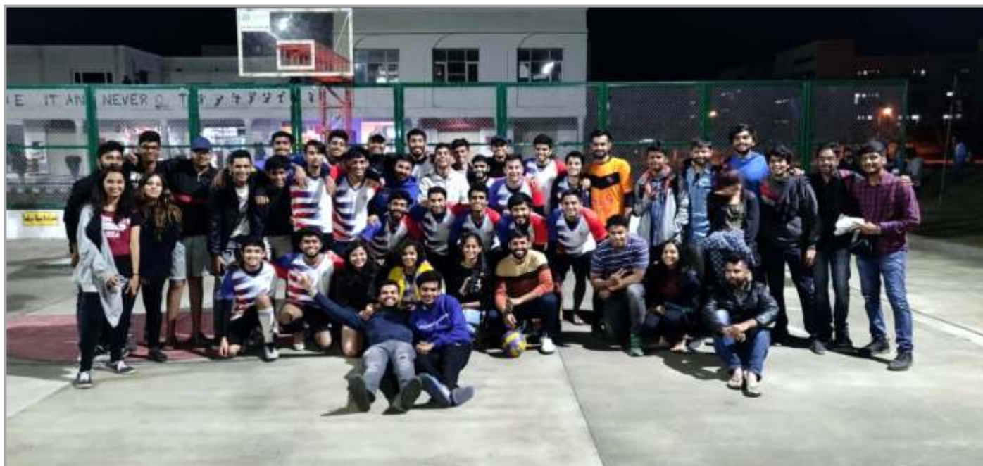
SLS Pune Sports Contingent.