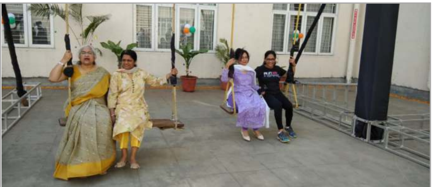
Exciting and Fun activities at the Event.

The Happy, Healthy Campus Event was hosted at New Viman Nagar Campus of Symbiosis International University on 10th January 2019 between 11 am to 1 pm. This two-hour event was filled with fun, physical activities and adventure games which honed the physical, social and moral capacities of the participants. The objective of this event was to promote health and wellness amongst the students, faculty and the staff.