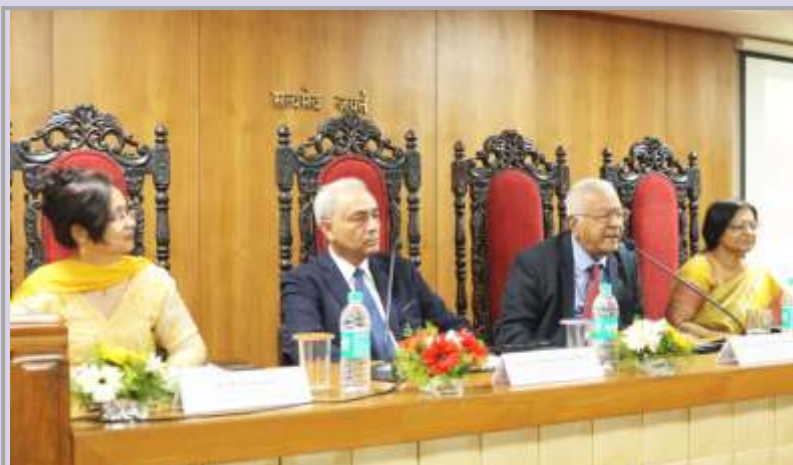
Panel for the Opening Ceremony of SICTA 2019

Panel for the Opening Ceremony of SICTA 2019 The Fourth Edition of the Symbiosis Law School, Pune, International Criminal Trial Advocacy Competition (SICTA) was held from 28th March to 30th March 2019. The three-day competition hosted teams from 24 law schools including 2 foreign law schools namely, University of Bristol, UK and Nepal Law Campus, Nepal.