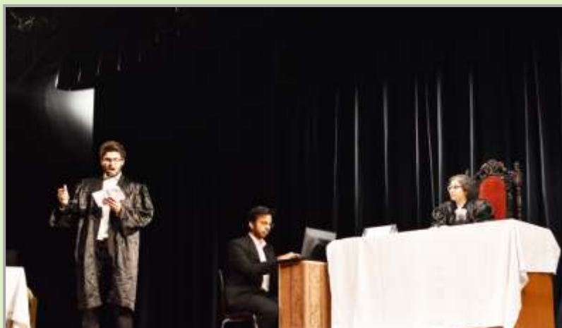
Law Theatre 2019 : "Mere Hisse Ki Dhoop"