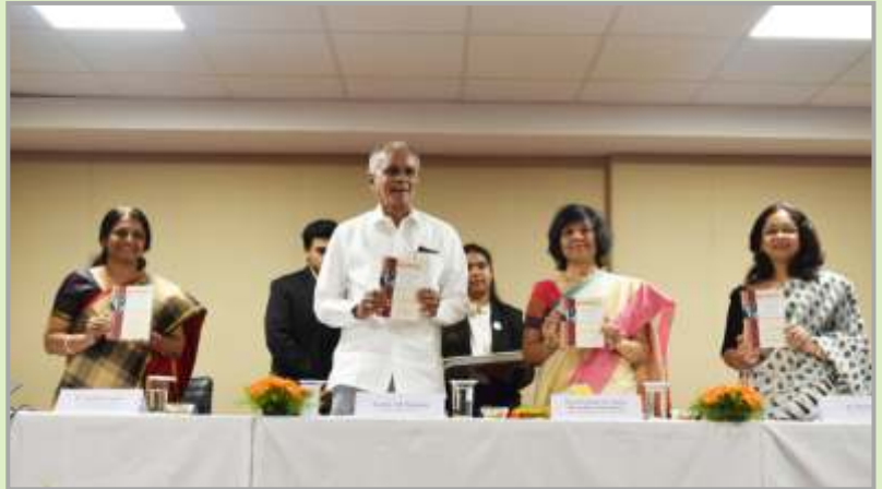
Release of LexET