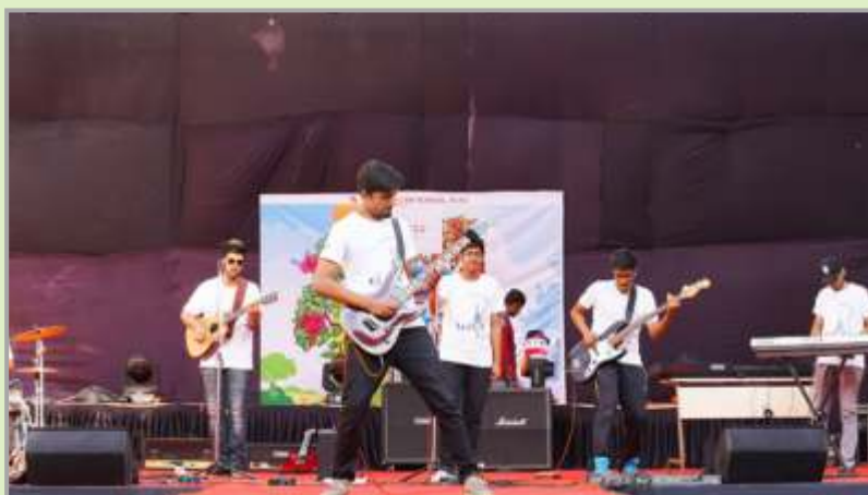
Battle of the Bands